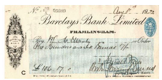
Barclays cheque of 1922. Note Gurney name.

To a previous generation, it would have been inconceivable that the bank would ever close. Their closure information states that 86% of Framlingham customers have banked online by some means, and only 25 customers regularly use the bank as their only means. The bank now has a Pop Up shop in the Crown Hotel on Monday to Wednesday 09.00 to 17.00 (closed 12.30 to 13.30), and Thursday 09.00 to 12.30, where various transactions can be made but no cash handling.