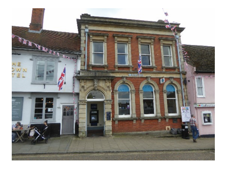
The final days of the bank in Framlingham, 2023.