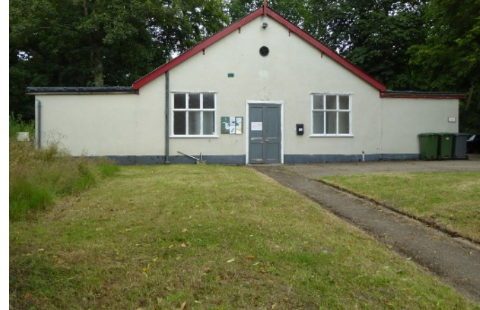
St Michael's Rooms. Built 1890, demolished early 2022 to make way for the new Castle Community Rooms.